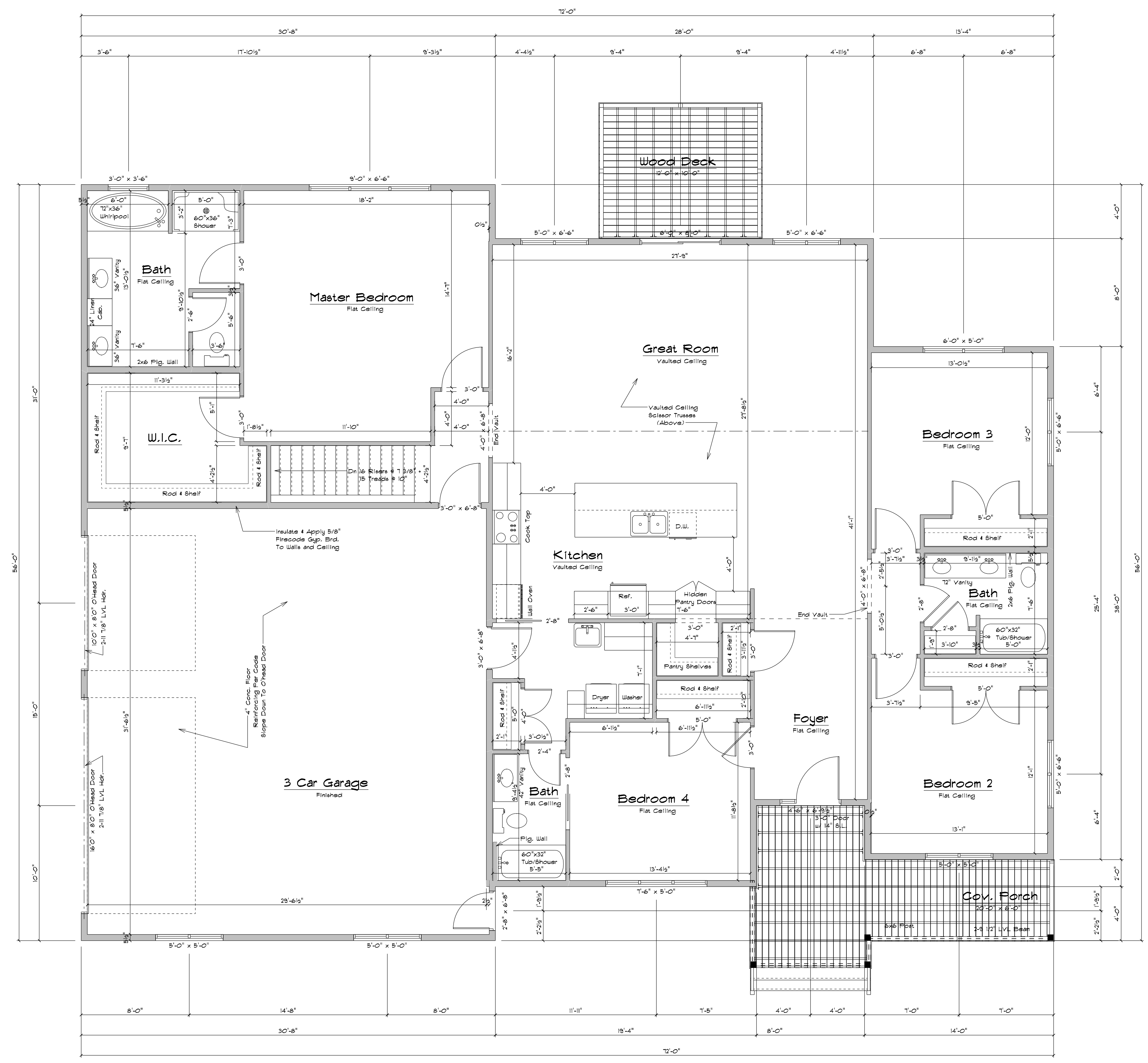
Main Level Floor Plan 2550 Sq. Ft. Living 962 Sq. Ft. Garage 3/16" = 1'-0"